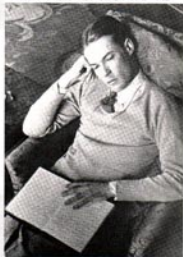
Overlooked & Underrated

Secure yourself to whatever is available